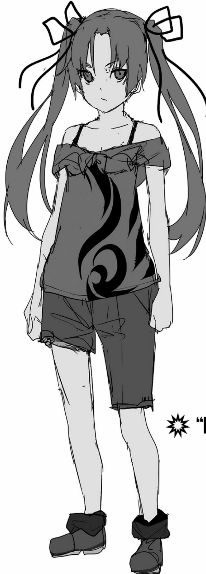
✦ "FLAME PRINCESS" ASHLEY